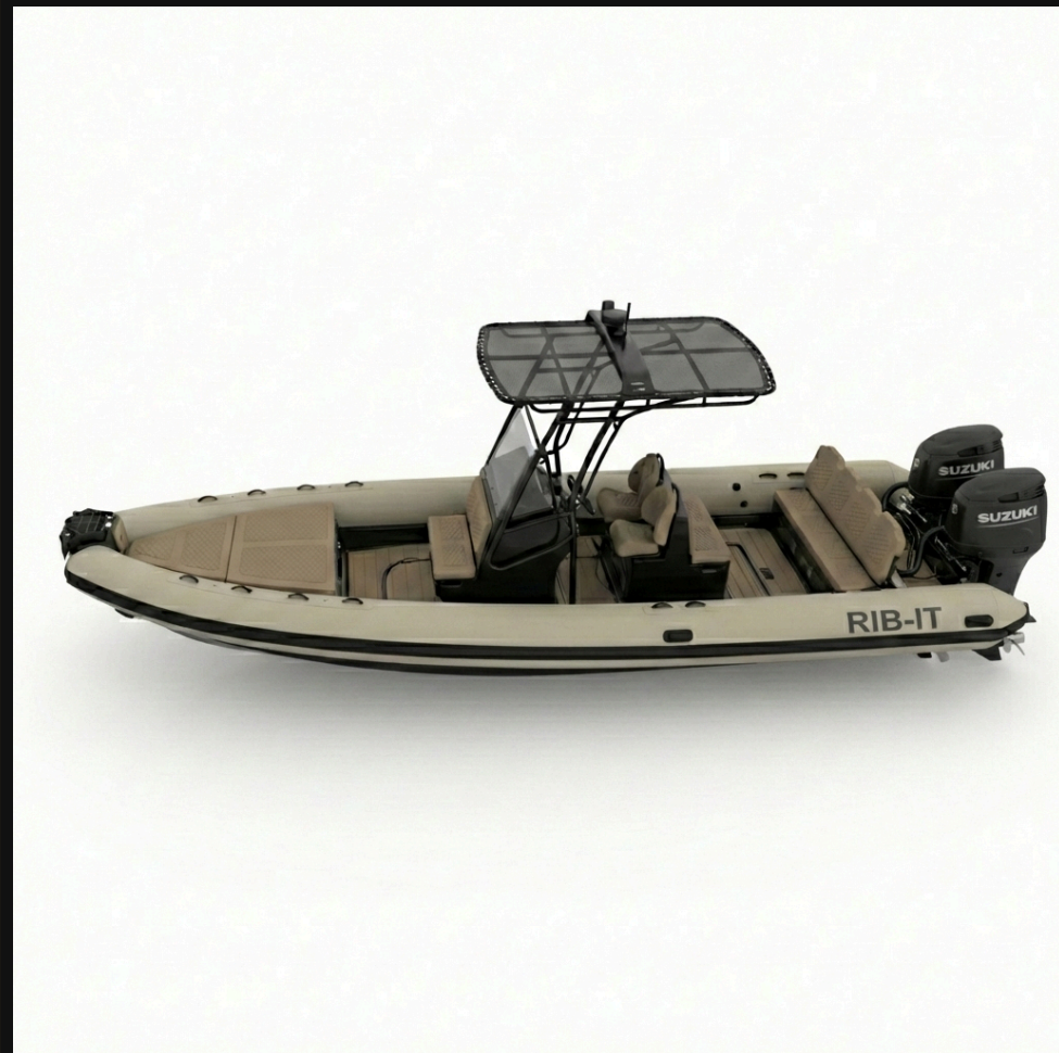
TAN BUILD · FULL INTERIOR LAYOUT 6' 4" Internal Beam · 110-Gal Dual Tank · 18 Passengers