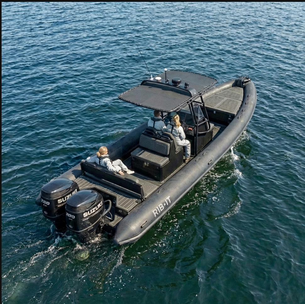
TWIN SUZUKI 200HP · BLACK BUILD · PATROL READY Category B · Hi-Drive Racing Hydraulics · Fly-By-Wire Precision Control

RIB-IT SP900 · 30' ELITE TWIN CENTER CONSOLE